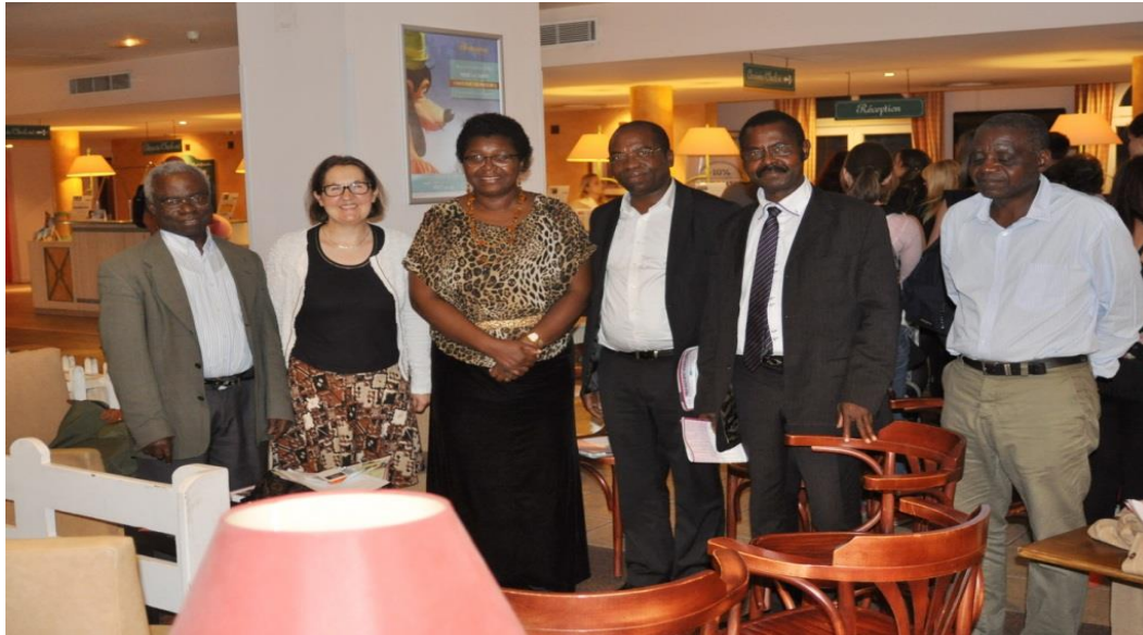
SENSITISATION ON THE NIGERIAN HEALTH SOLUTIONS NETWORK IN PARIS, FRANCE AUGUST 2014